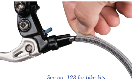
See pg. 123 for bike kits.

Under low light conditions, the retroreflective strands in F6® Reflex® sleeving reflect light up to 1,500 times more efficiently than bright white sleeving.