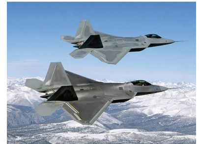
Used on both military and commercial aircraft to defend hose systems from fire and thermal events.