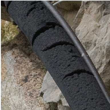
Protect your HVAC foam insulation from harmful UV rays with Dura HVAC Wrap.

With the introduction of new building code regulations regarding protection of foam insulation on HVAC line sets, Techflex has developed a new lightweight wrap to assist installers with code compliance. Our new Dura HVAC Wrap is constructed of a tightly woven breathable polyester shell that offers protection from wind, rain, mildew, UV rays and abrasion. The extra wide hook and loop closure assists in covering multiple diameters quickly and easily for a tight fit.